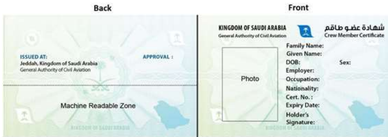
Figure 9.12.1.1, Sample CMC